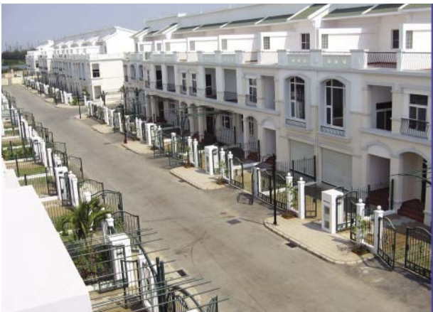
Fig 5: Apartments of middle classes' dreams

However, the property boom is increasingly preventing access to the housing markets for low-income groups, who still form the majority of Ho Chi Minh