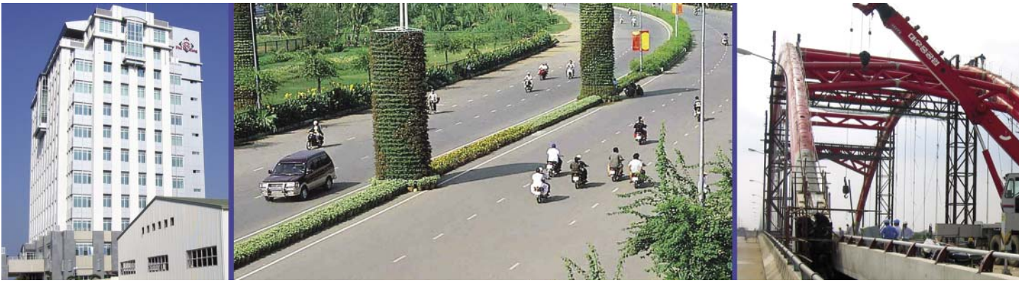
Fig 4: Elements of the universal toolbox of post-modern urbanity of any new town world-wide, as found in Saigon South

in 1997. The Saigon South City as well as - among others - the only foreign-invested housing project currently licensed in Hanoi, the $2.1 billion Ciputra Hanoi International City Project (managed by an Indonesian-Vietnamese joint venture company) are thus visual proof of Vietnam's ambition to increase its integration into a economically and culturally globalizing world. The visible outcome is an internationally standardised, consumer-oriented architecture (GOTSCH & PETEREK 2003: 1). Strangely, there seems to be no current empirical data on the target groups' aspirations and preferences towards this kind of uniform architecture and the coherent new urban area concepts.