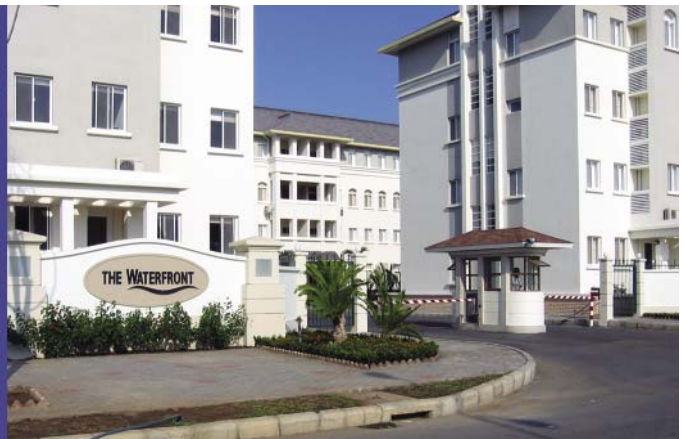
Fig 6: One of the first Gated-Communities in Vietnam