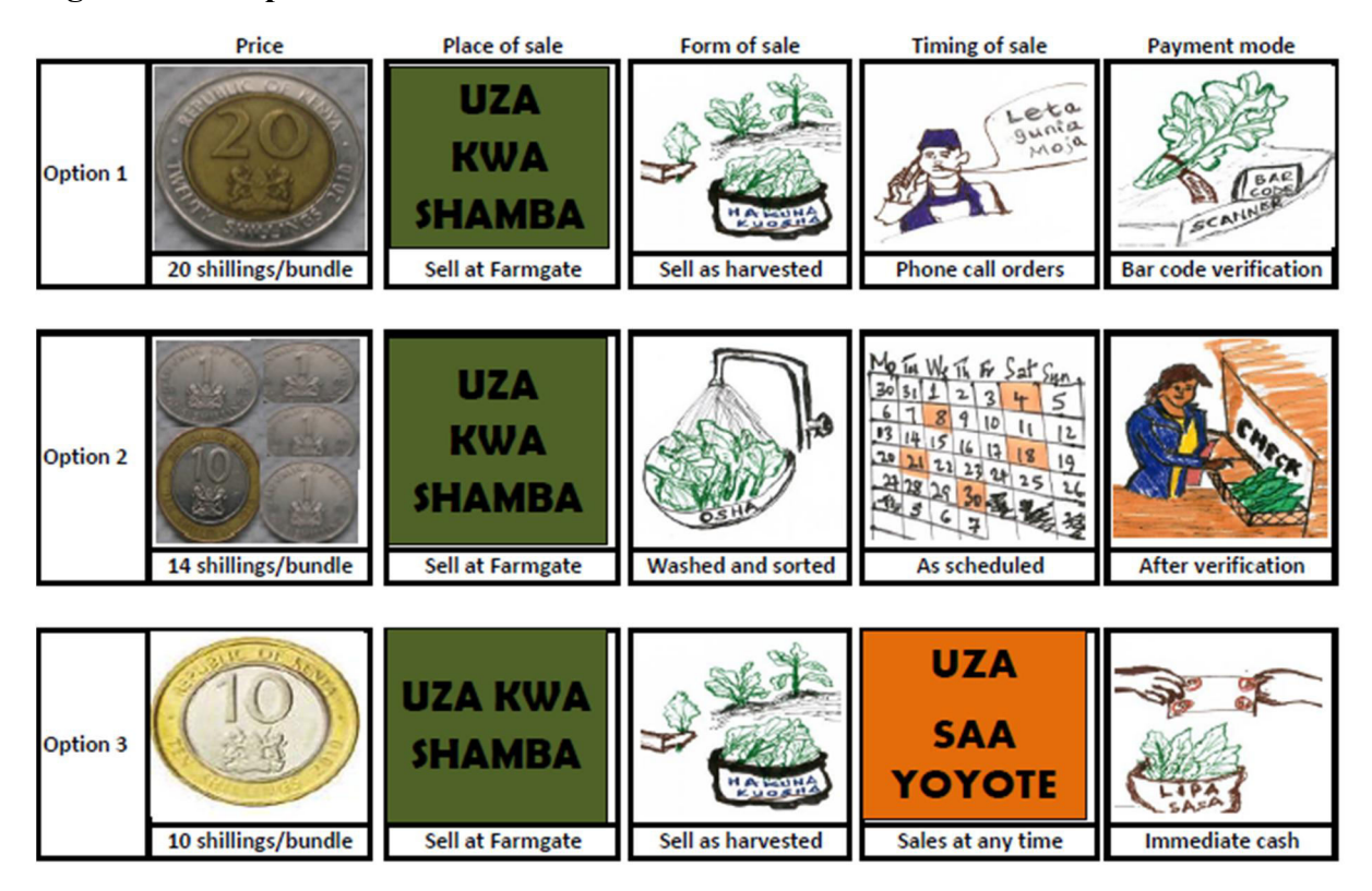
Figure 2. Example of a choice card